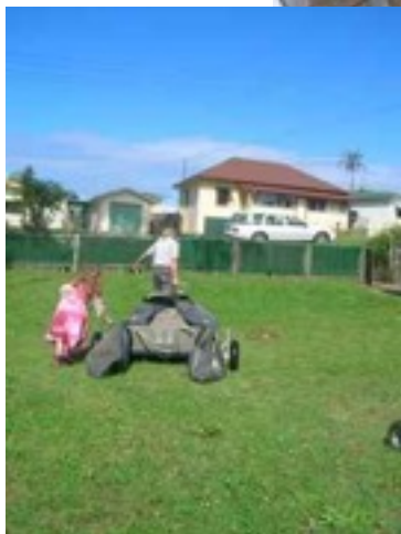
Right and Bottom Right: Your commodore unloading the Sailability gear today with a "Little" help.